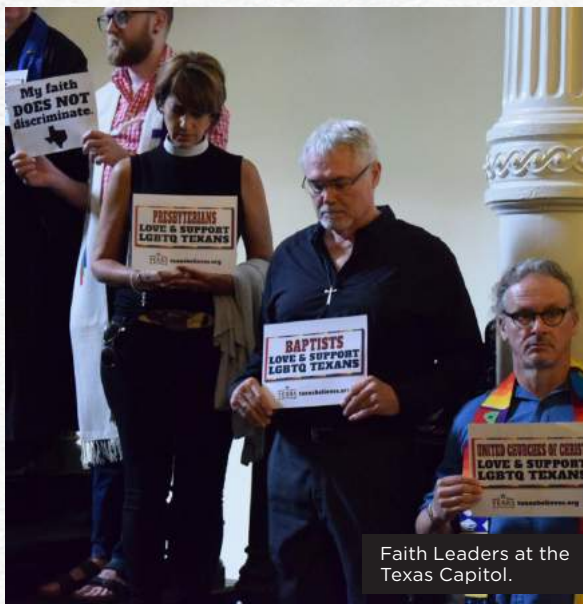
Faith Leaders at the Texas Capitol.

Texas Believes toured the state for a series of town halls to ensure that a faith perspective in support of fairness for all Texans is represented and heard by state leaders.