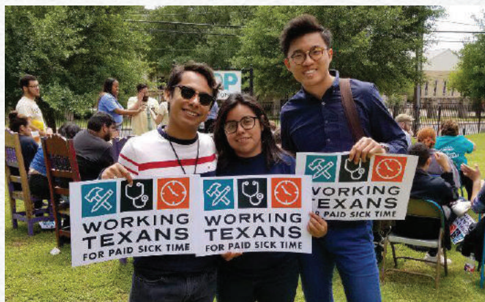
TFN served as a leading voice in the coalition to pass paid sick ordinances in Austin, San Antonio and Dallas.

In 2017, in their effort to strip funding from Planned Parenthood, state officials gave the anti-abortion Heidi Group millions of dollars in contracts for women's health services it was not qualified to provide. Predictably, The Heidi Group failed. In a galling move, officials renewed their contracts. News of that renewal came to light thanks to documents uncovered by TFN and the Campaign for Accountability. In October 2018, the state announced it would cancel the group's remaining contracts and launch an investigation into how the funds were spent.