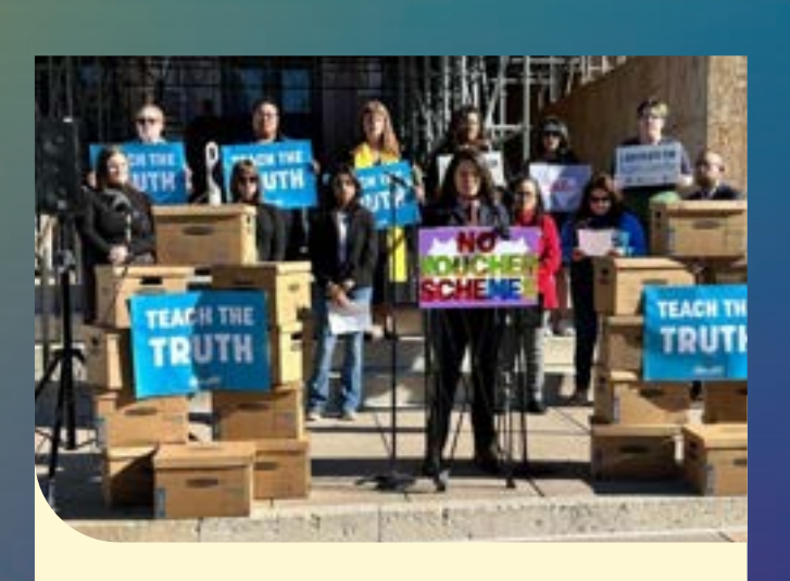
TFN organized a press conference before delivering close to 5,000 petitions against voucher schemes to legislators.

Neighborhood public schools are the heart of every community. They accept all students, regardless of who they are or their background. Instead of supporting our public education system, Governor Abbott chose to push forward his school voucher schemes that divert essential funding to subsidize tuition at unregulated private and religious schools. TFN advocates and legislative champions defeated voucher schemes in the regular legislative session, and the next four special sessions called by Abbott. But we know it's not over as Abbott has promised to endorse pro-voucher candidates and push more legislation attempts to erode our public school system. TFN has stopped vouchers before, and we'll continue our work to do it again.