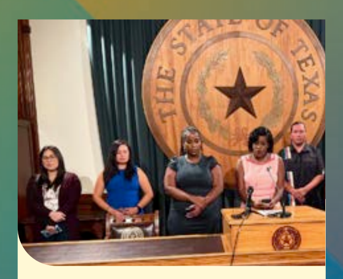
TFN Political Director joins SBOE members to denounce controversial PragerU curriculum materials.

Since TFN's founding in 1995, we've been the resource of record for monitoring the religious right in Texas. In 2023, we once again sprang into action the minute we found out that a newly elected extremist State Board of Education (SBOE) member was in talks to bring the ultra-right-wing propaganda company PragerU to our schools. We took to our trusted media sources to spread the facts about the company masking its propaganda as educational material, and we filed a request to see all communications between PragerU and any SBOE members. As this controversy continues to unfold, TFN will be there every step of the way.